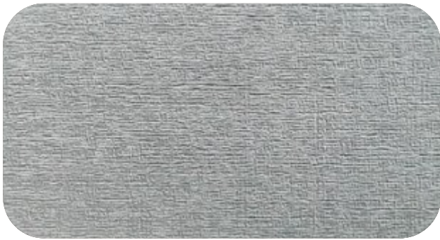
IRIS - 818