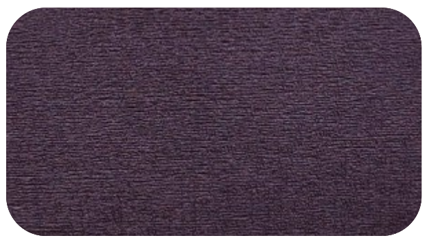
IRIS - 817