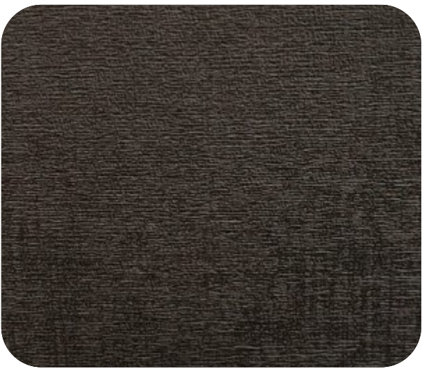
IRIS - 811