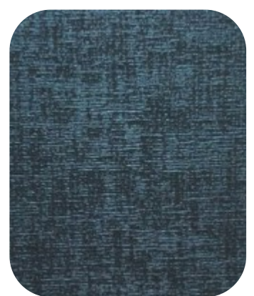
IRIS - 815