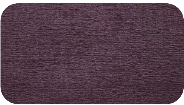
IRIS - 816