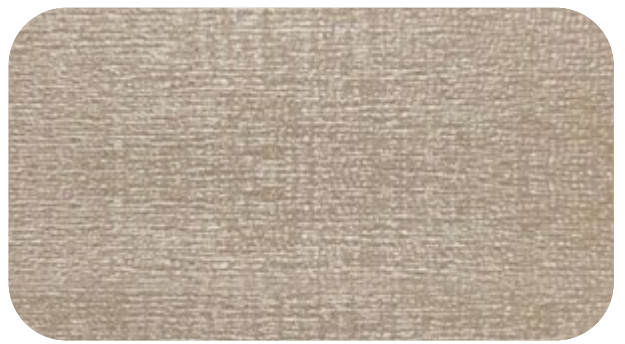
IRIS - 805