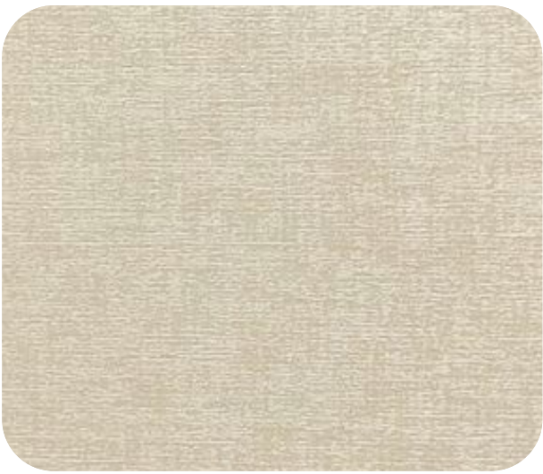
IRIS - 803