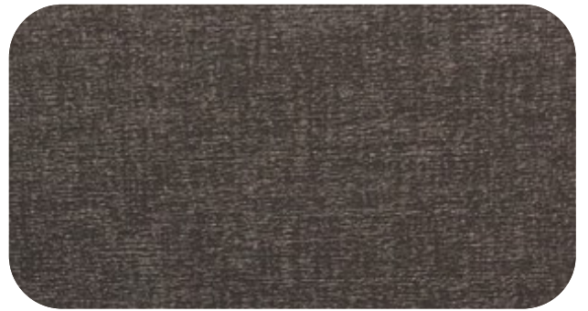
IRIS - 809