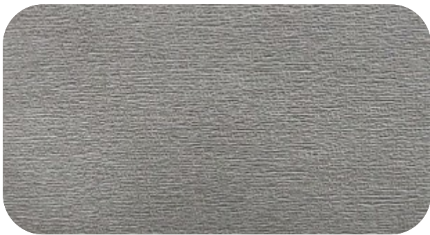
IRIS - 819