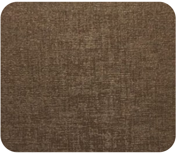
IRIS - 808