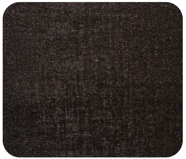
IRIS - 812