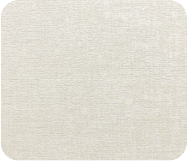
IRIS - 801