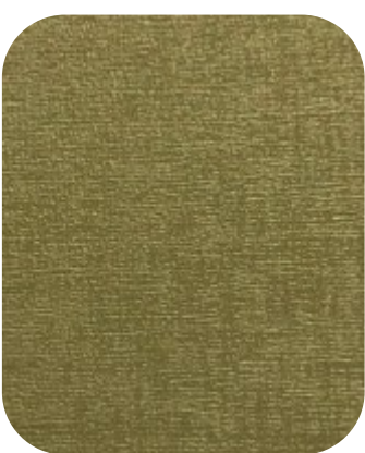
IRIS - 813