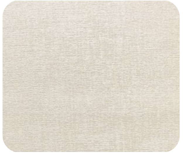
IRIS - 802