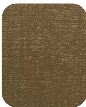
IRIS - 814