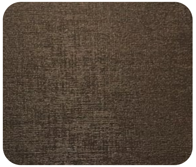
IRIS - 810