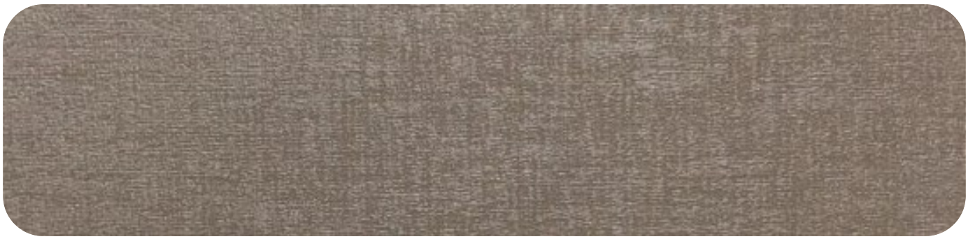
IRIS - 821