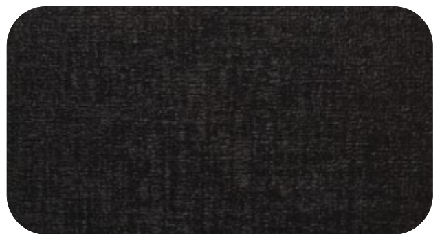
IRIS - 823