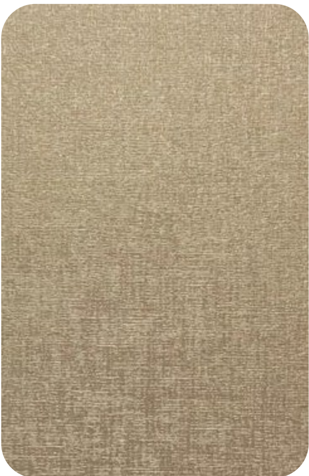
IRIS - 807