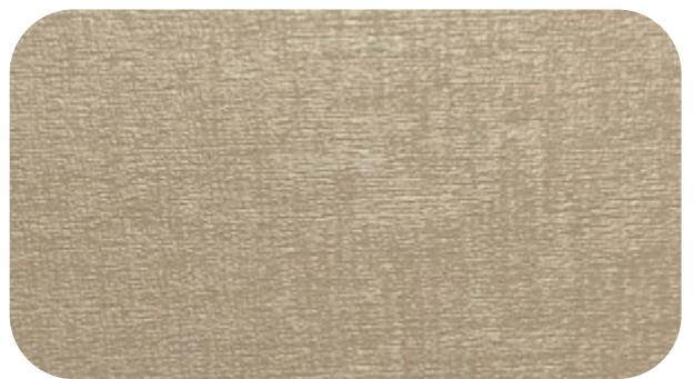
IRIS - 806