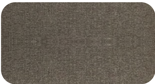
IRIS - 820