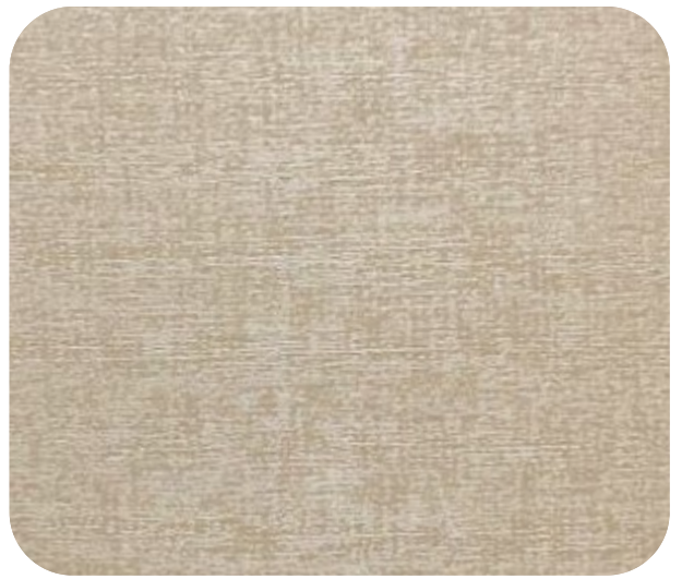
IRIS - 804