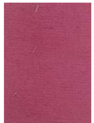
VELVETO | 923