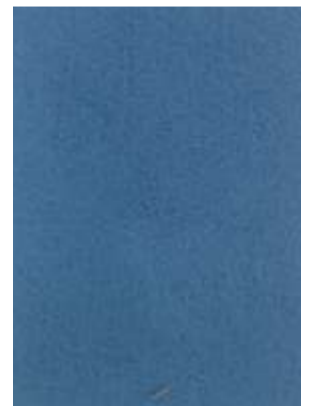
VELVETO | 971