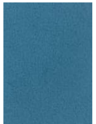
VELVETO | 970