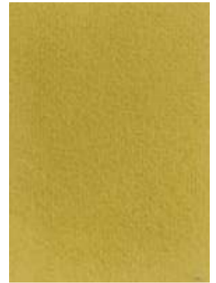
VELVETO | 917