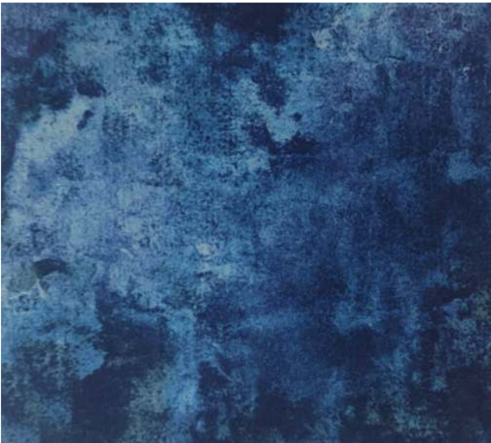
HALDEN | 920