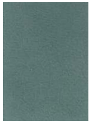
VELVETO | 963