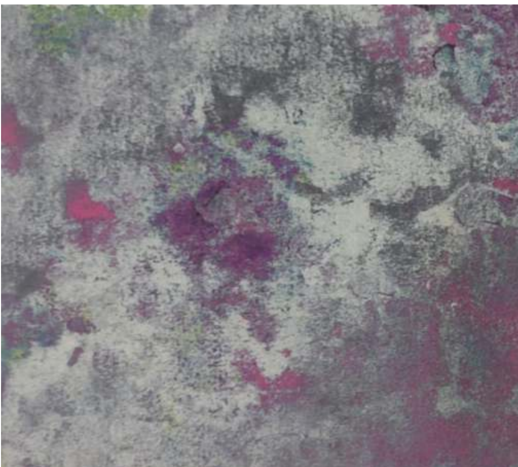
HALDEN | 921