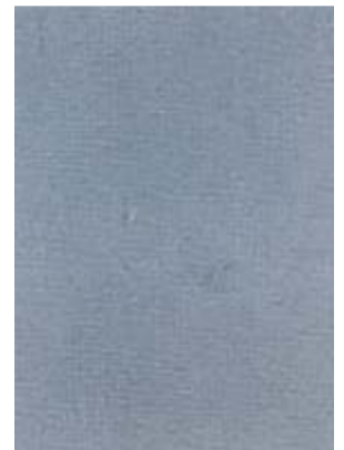
VELVETO | 968