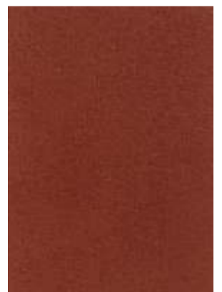
VELVETO | 928