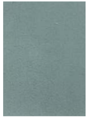
VELVETO | 964