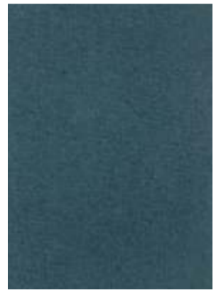
VELVETO | 961