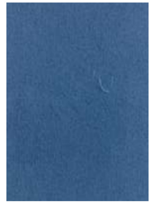
VELVETO | 971