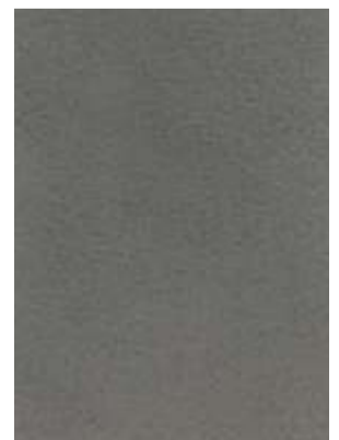
VELVETO | 945