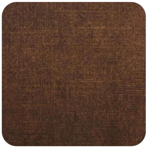
GLAZE - 109