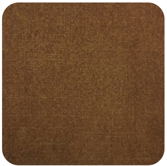
GLAZE - 108