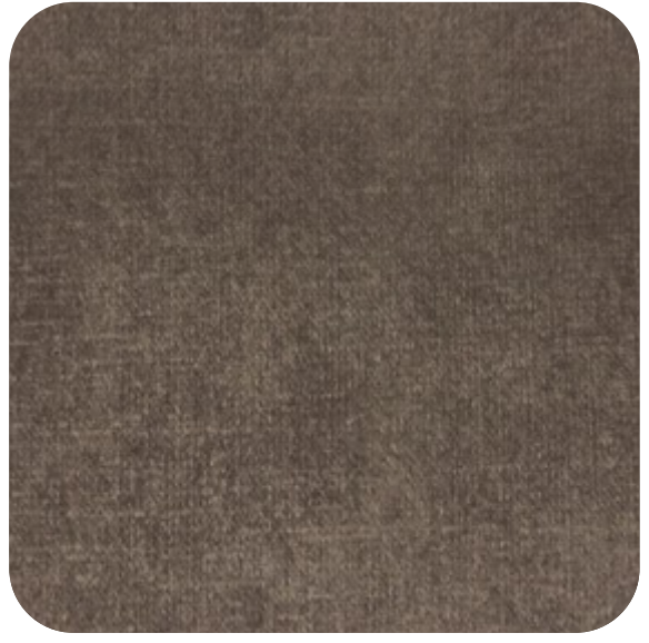
GLAZE - 116