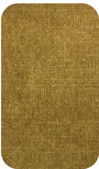
GLAZE - 111