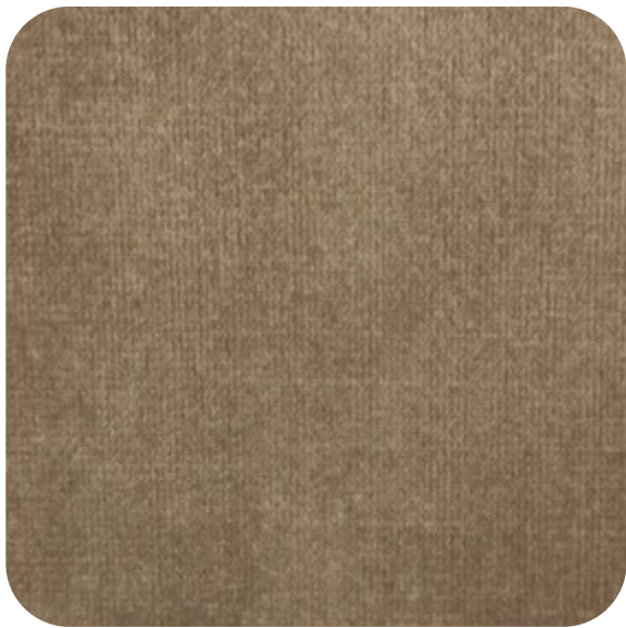
GLAZE - 103