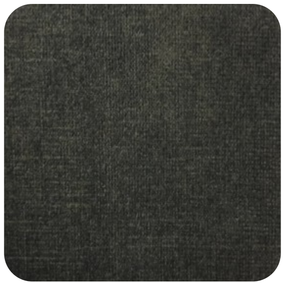
GLAZE - 118