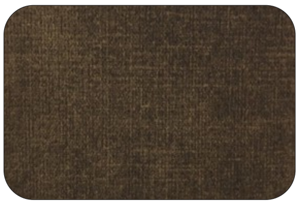
GLAZE - 106