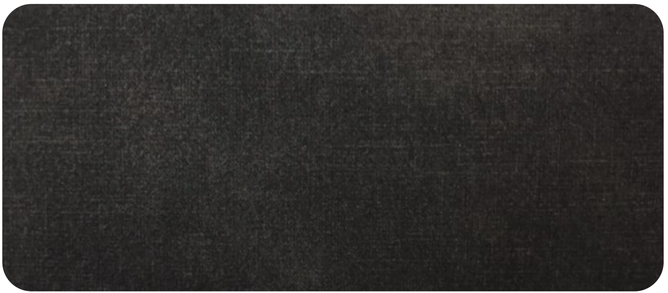
GLAZE - 119