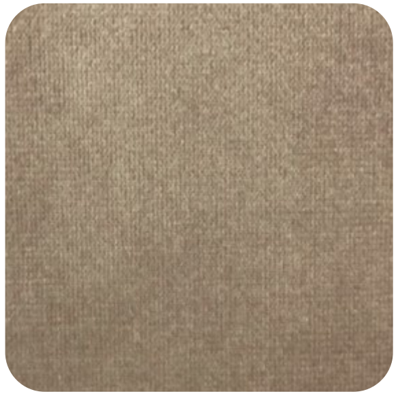
GLAZE - 102