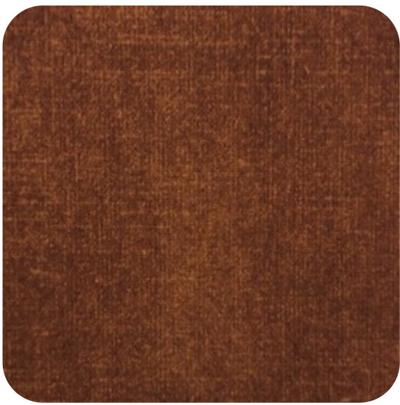
GLAZE - 110