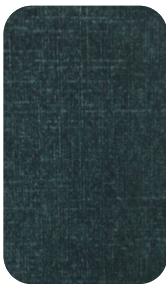
GLAZE - 112