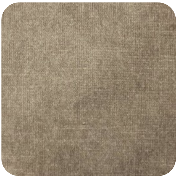
GLAZE - 117