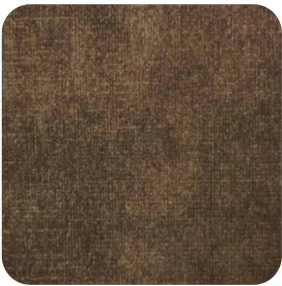
GLAZE - 104