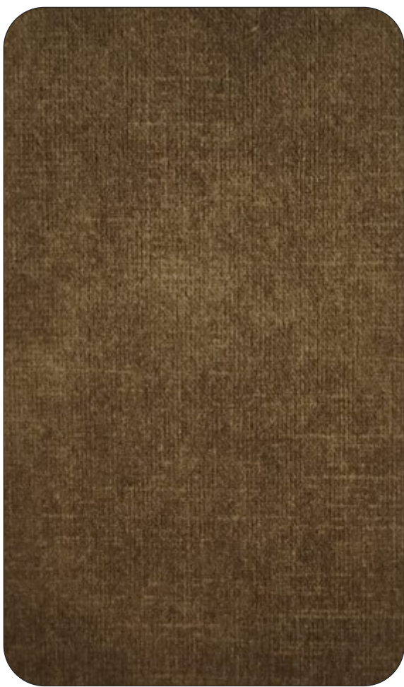
GLAZE - 105