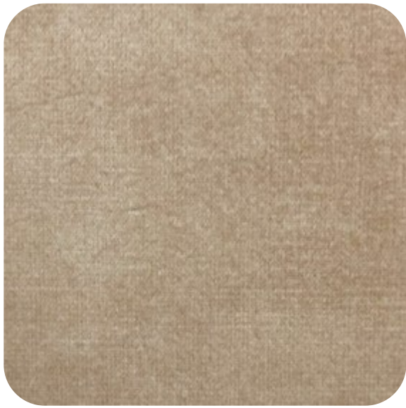
GLAZE - 101