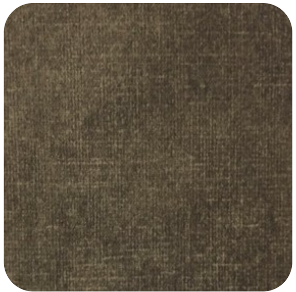
GLAZE - 114