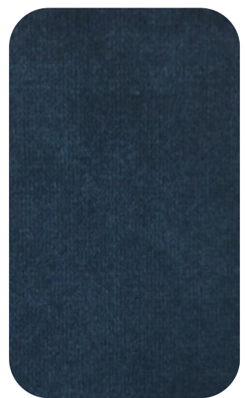
GLAZE - 113