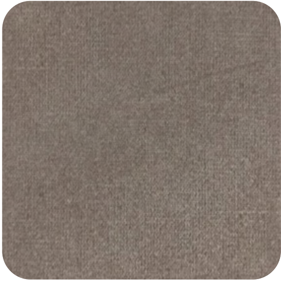
GLAZE - 115