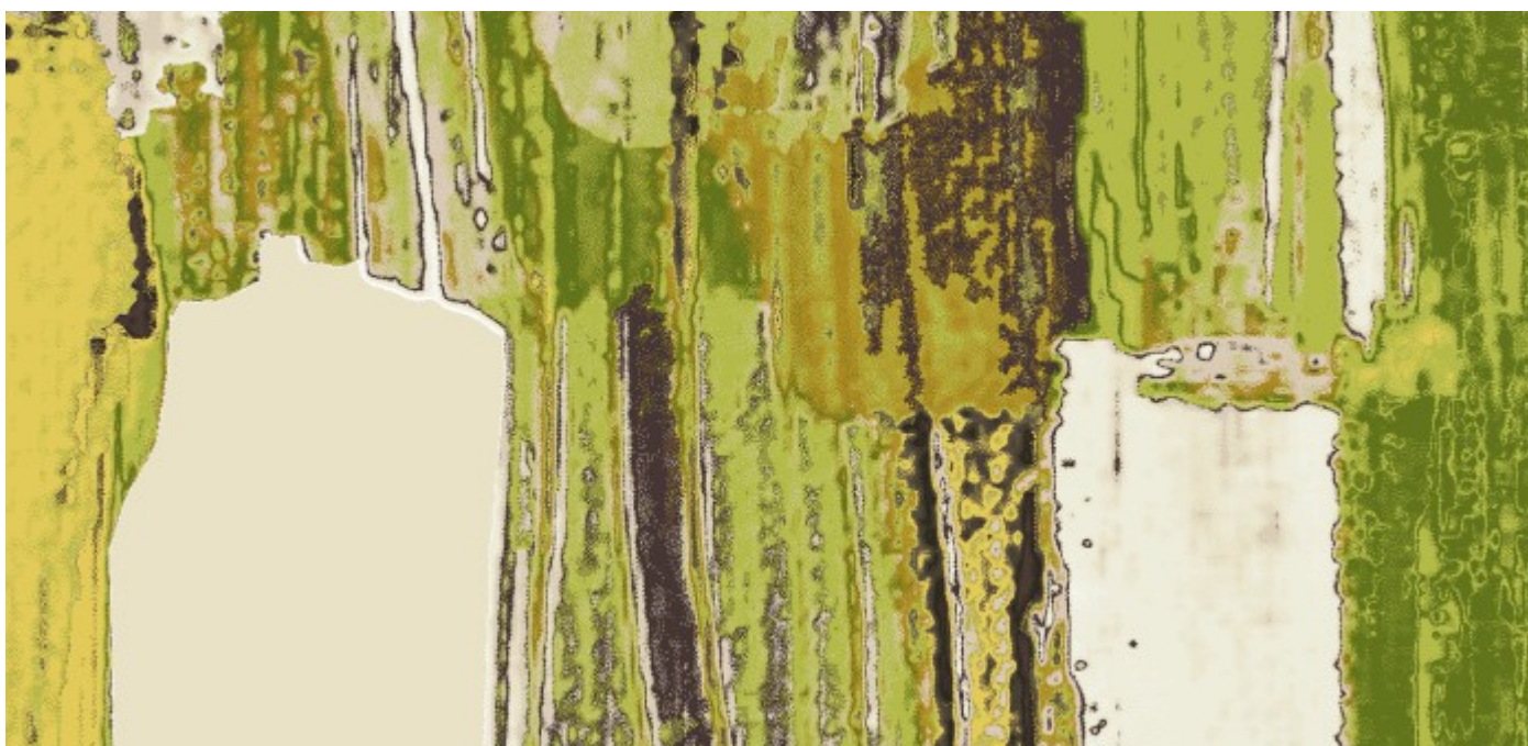
FRENCH COLLECTION - 2 | VOL- II DIJON - 705