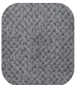
AMAZON - 915