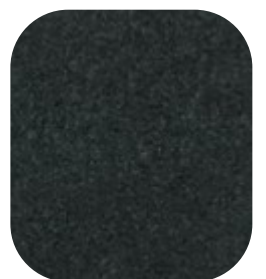
RENO - 910