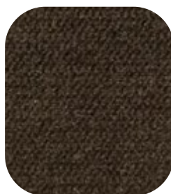
CAROLINA - 907