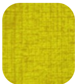
CAIRO - 909