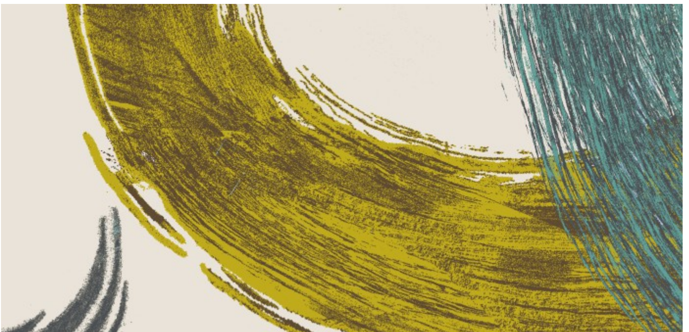
FRENCH COLLECTION - 2 | VOL- II DOLE - 706