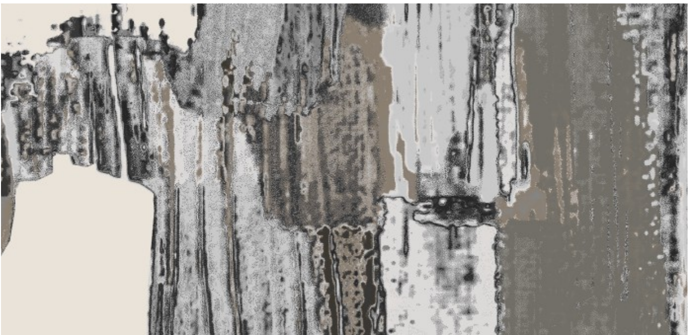
FRENCH COLLECTION - 2 | VOL- II DIJON - 708