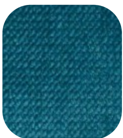
CAROLINA - 921