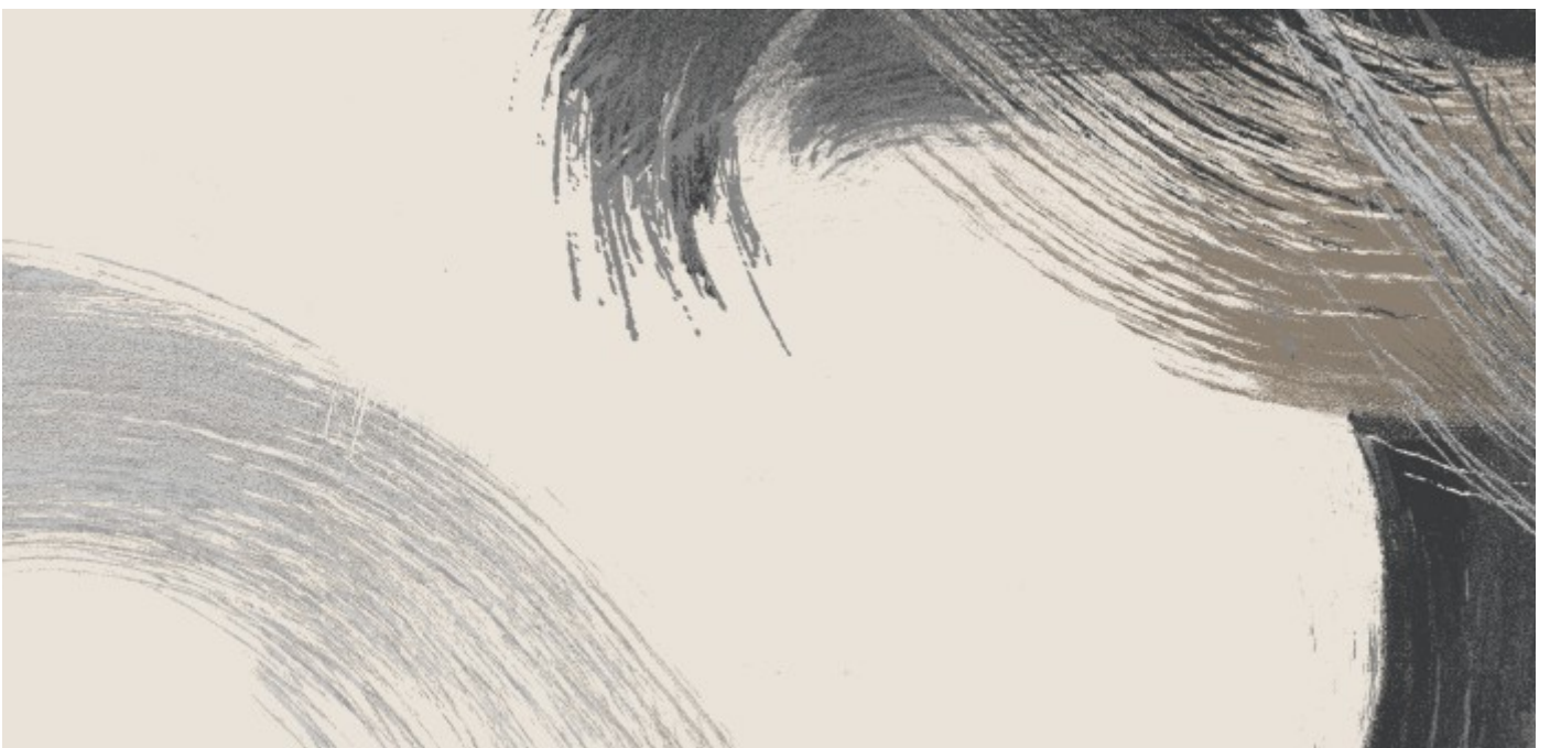
FRENCH COLLECTION - 2 | VOL- II DOLE - 708