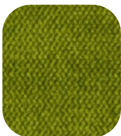
CAROLINA - 910