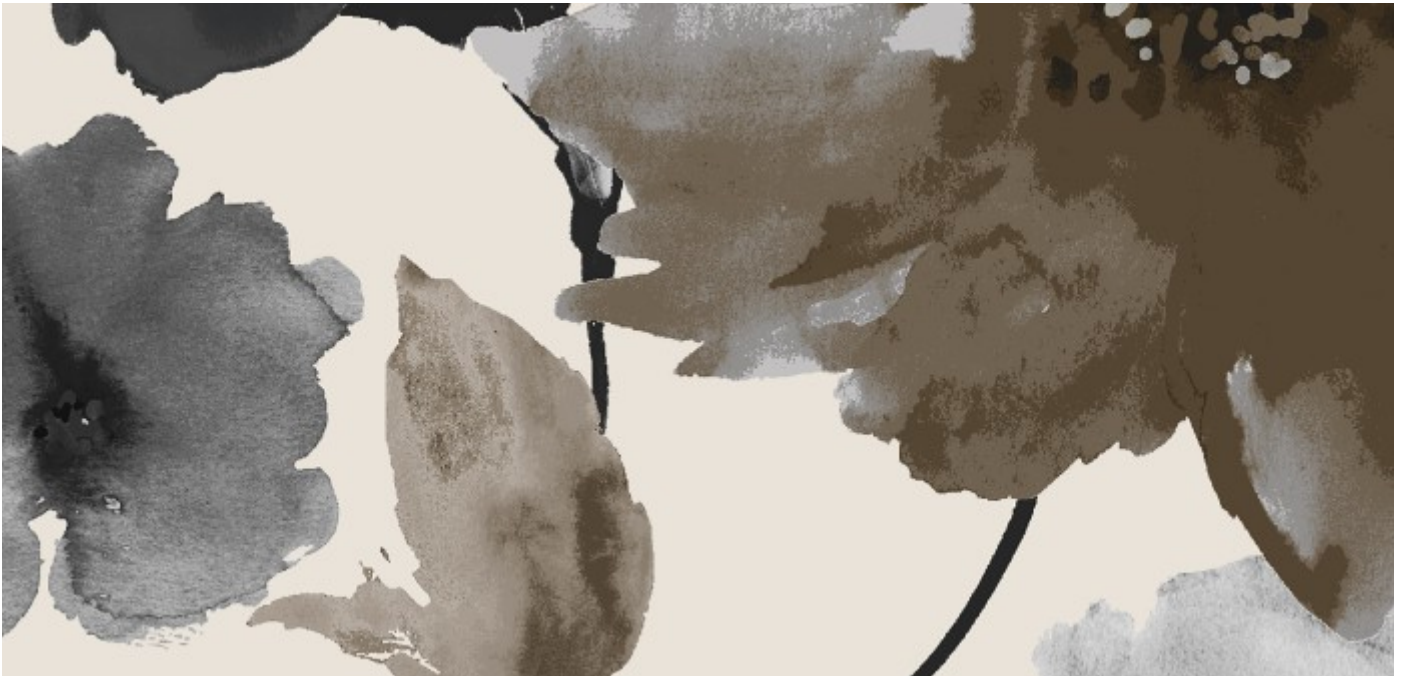
FRENCH COLLECTION - 2 | VOL- II NIMES - 708