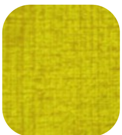
CAIRO - 909