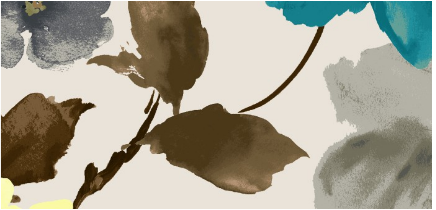
FRENCH COLLECTION - 2 | VOL- II NIMES - 706