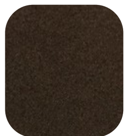
RENO - 907