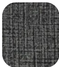
CAIRO - 923