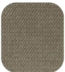
CAROLINA - 925