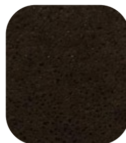
APACHE - 908