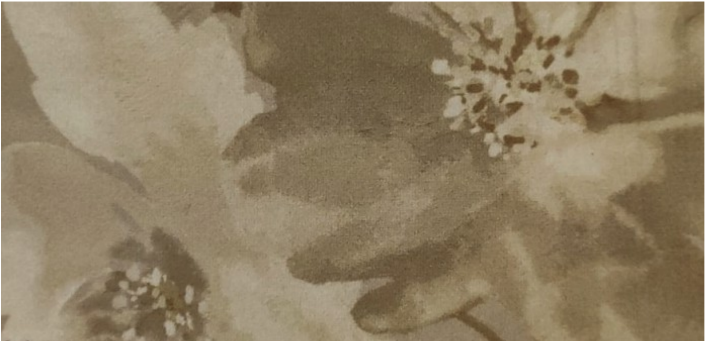
FRENCH COLLECTION - 2 | VOL- I NIMES - 701