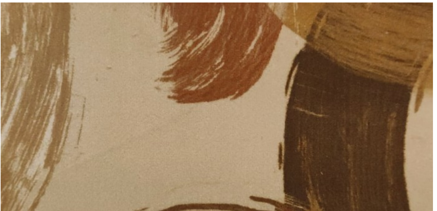
FRENCH COLLECTION - 2 | VOL-I DOLE - 702