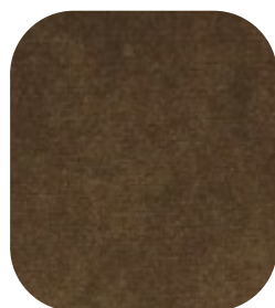
LISABEL - 712