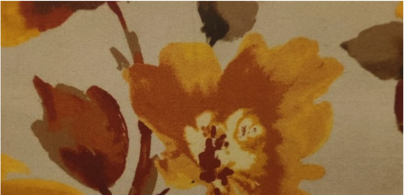
FRENCH COLLECTION - 2 | VOL- I NIMES - 703