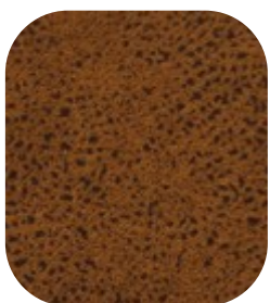
APACHE - 909