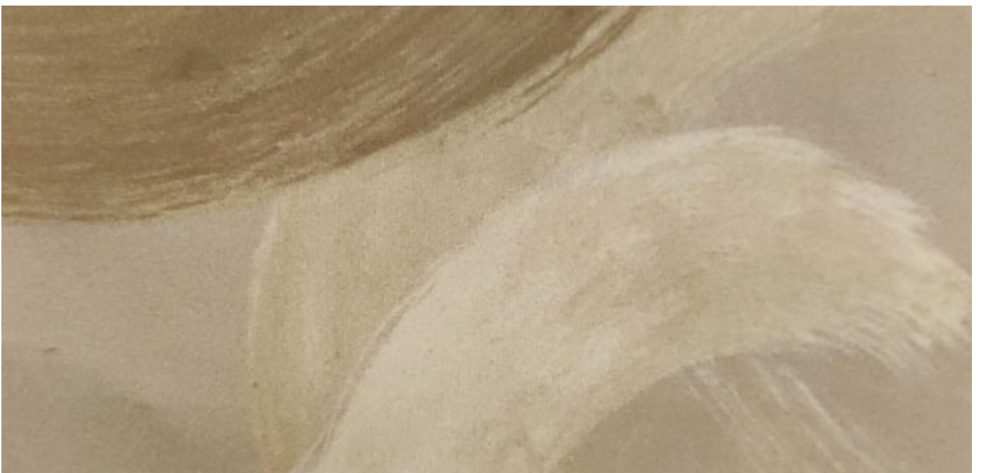
FRENCH COLLECTION - 2 | VOL- I DOLE - 701