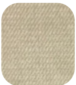
CAROLINA - 902