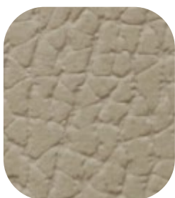
LARGOVA - 902