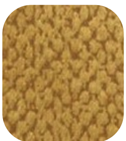
AMAZON - 912