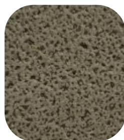
PANACHE - 924