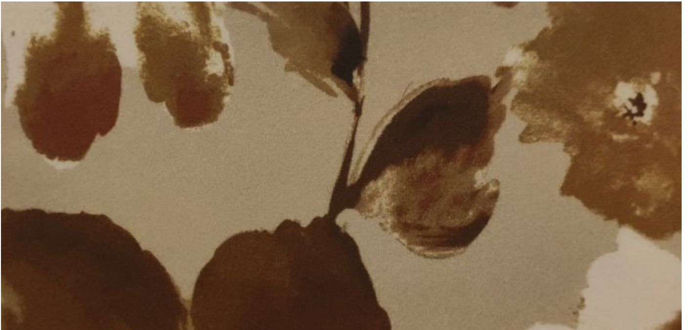
FRENCH COLLECTION - 2 | VOL-I NIMES - 702