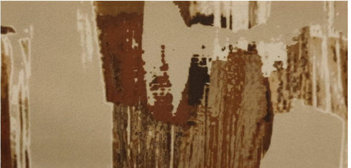
FRENCH COLLECTION - 2 | VOL-I DIJON - 702