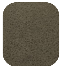
APACHE - 912