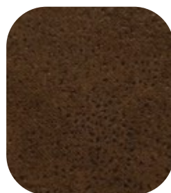
APACHE - 906