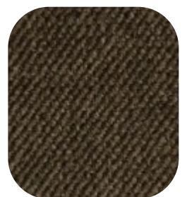
CAROLINA - 906