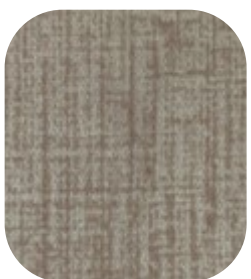
CAIRO - 904