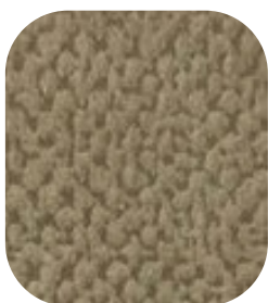
AMAZON - 904