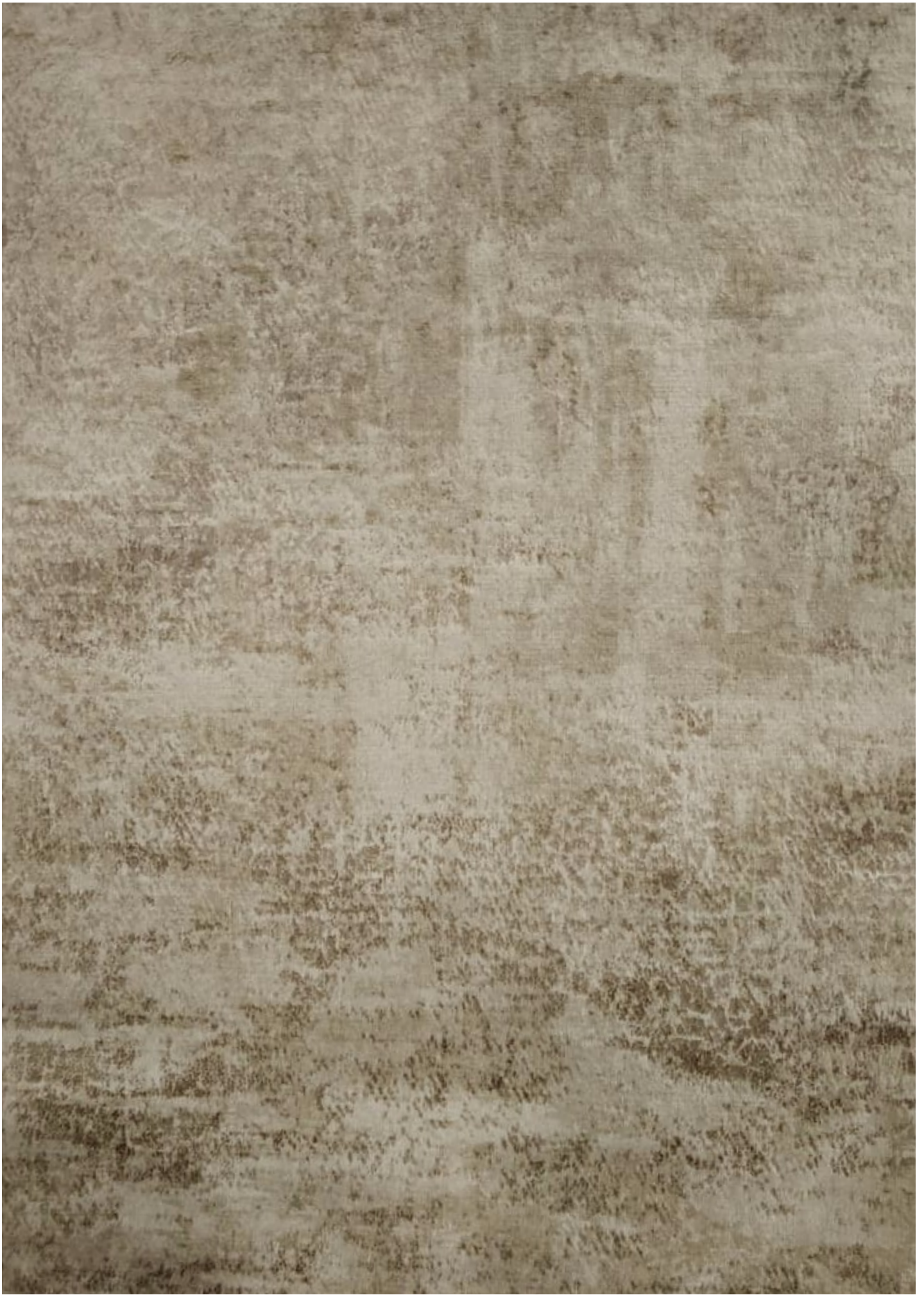
ELEGANT - 104