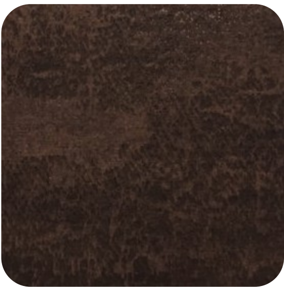
ELEGANT - 106