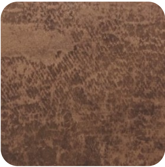
ELEGANT - 105