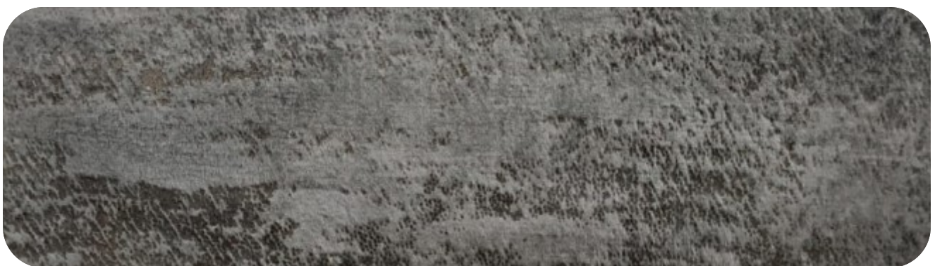
ELEGANT - 109