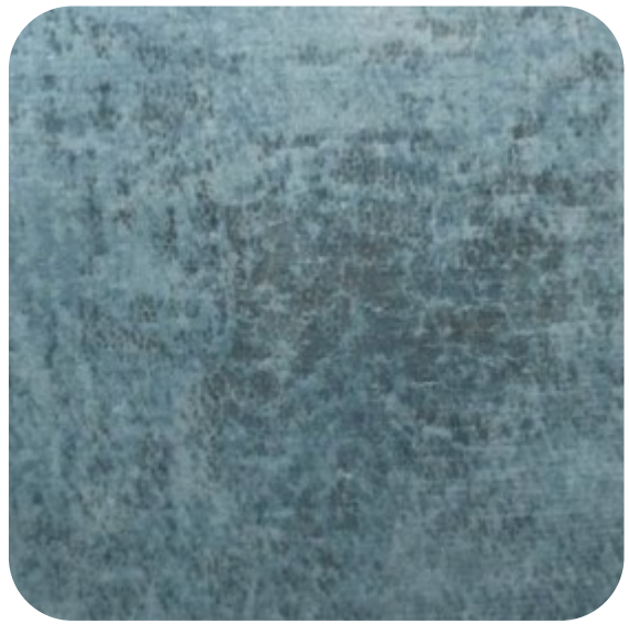
ELEGANT - 110