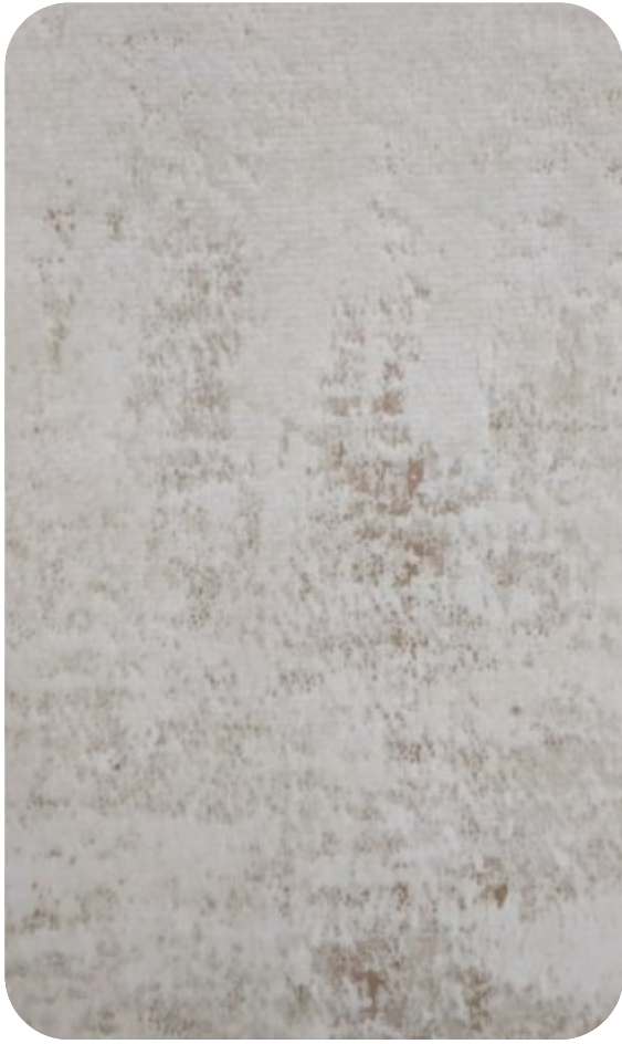
ELEGANT - 101