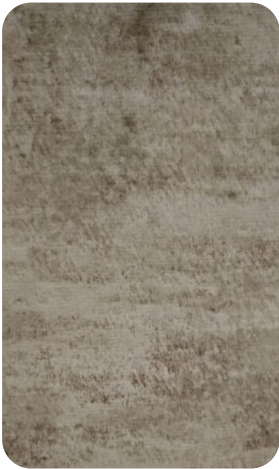
ELEGANT - 104