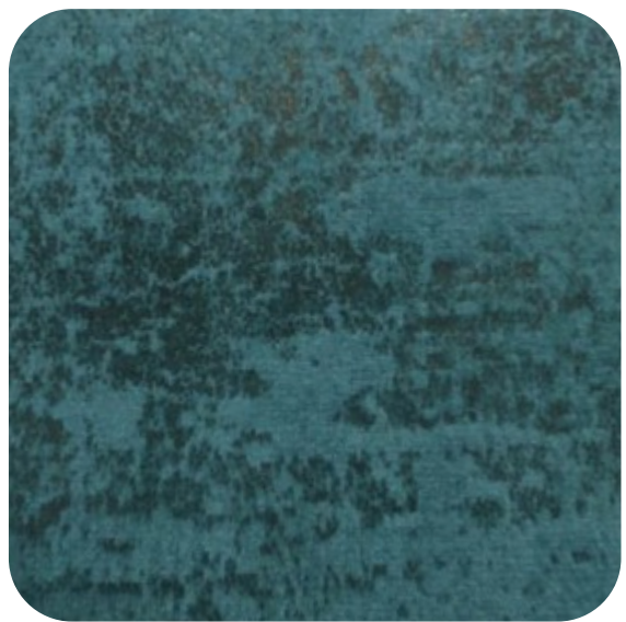
ELEGANT - 111