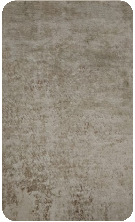
ELEGANT - 103