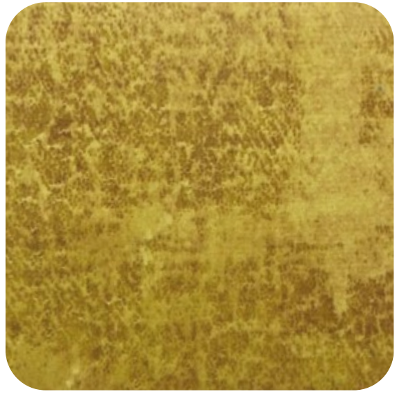
ELEGANT - 112