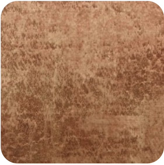
ELEGANT - 113