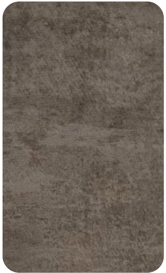
ELEGANT - 107