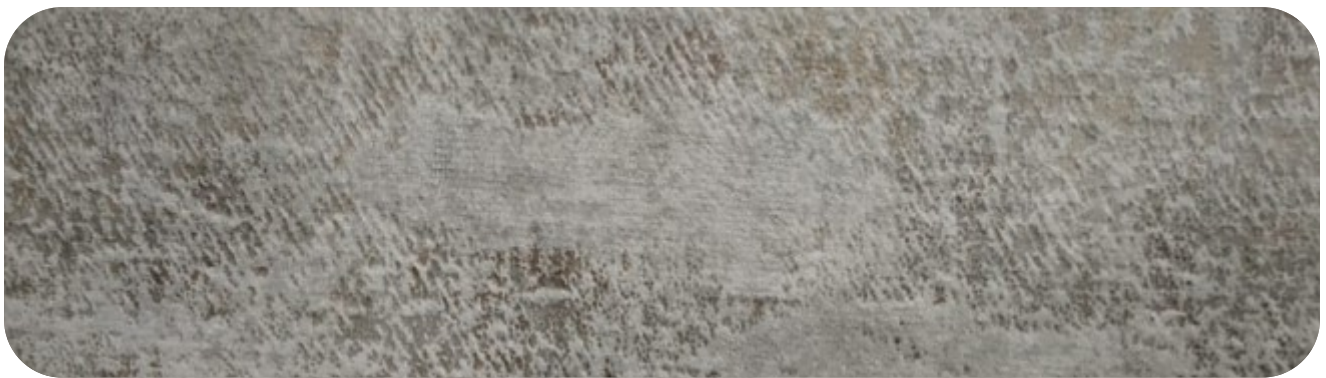
ELEGANT - 108