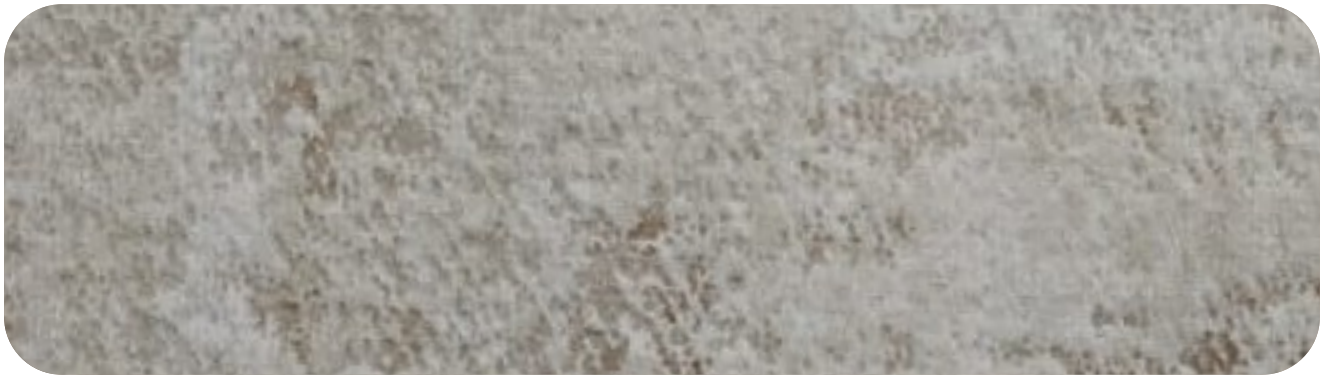
ELEGANT - 102