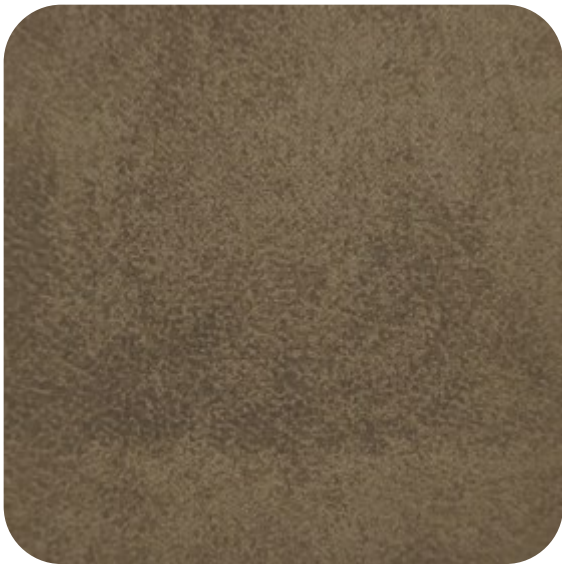
COWBOY - 902