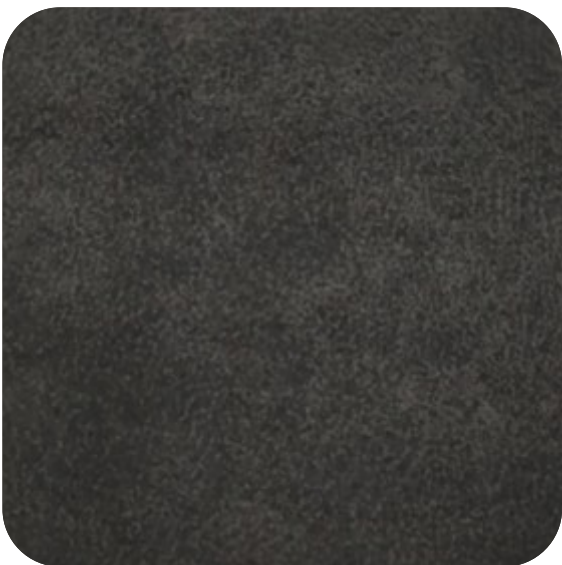
COWBOY - 913