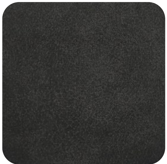
COWBOY - 912