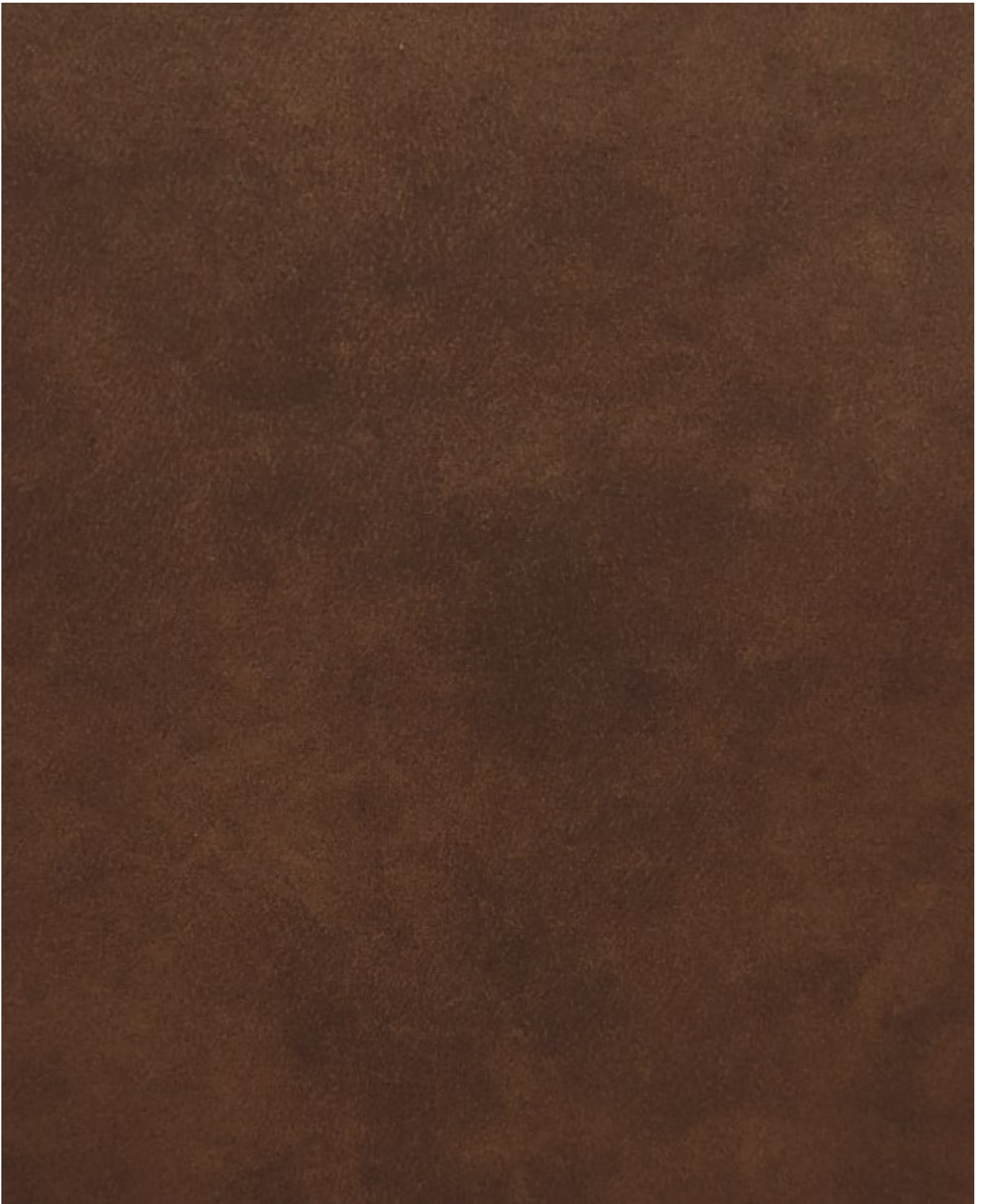
COWBOY - 905