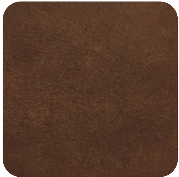
COWBOY - 905