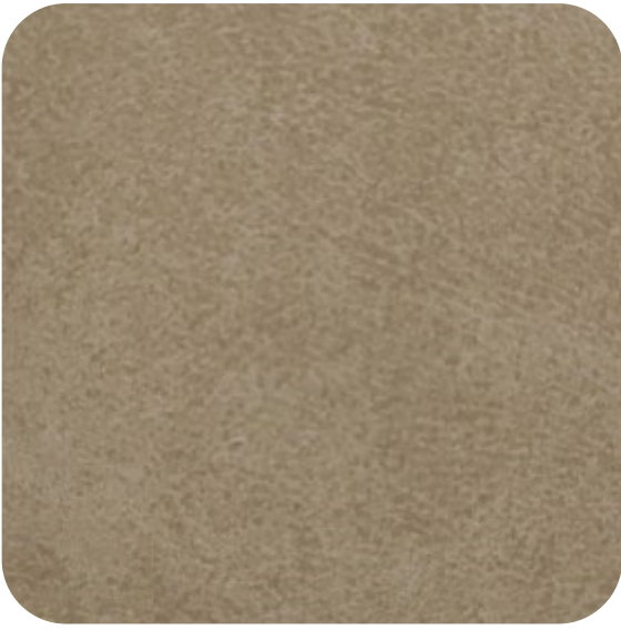
COWBOY - 901