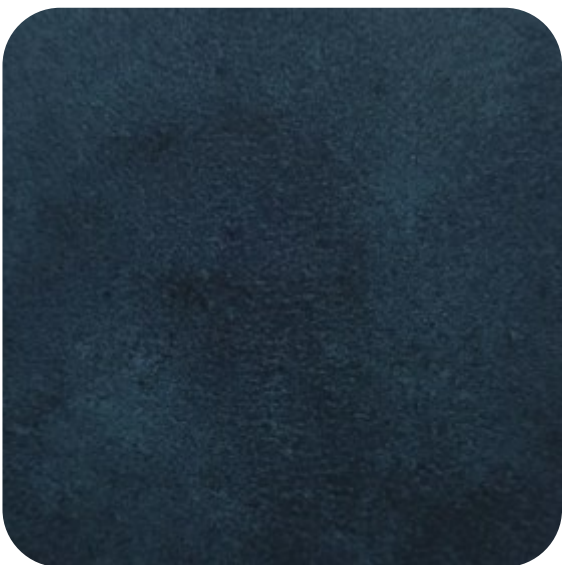
COWBOY - 914