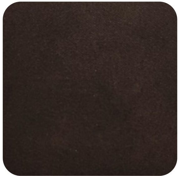
COWBOY - 908