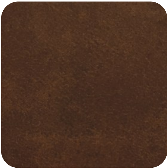
COWBOY - 906