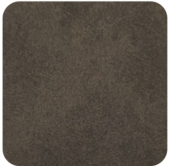
COWBOY - 909