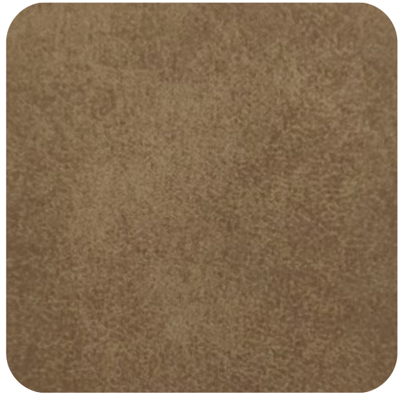
COWBOY - 903