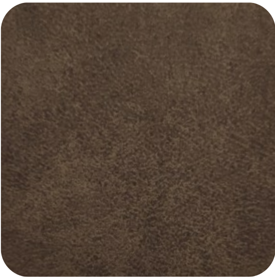
COWBOY - 904