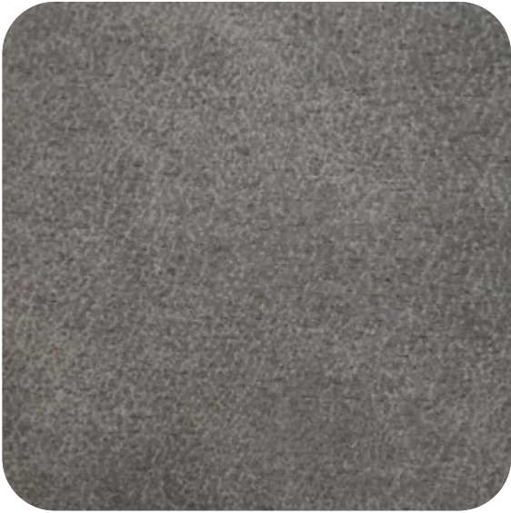
COWBOY - 910