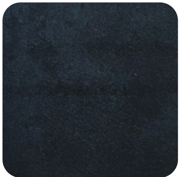
COWBOY - 915