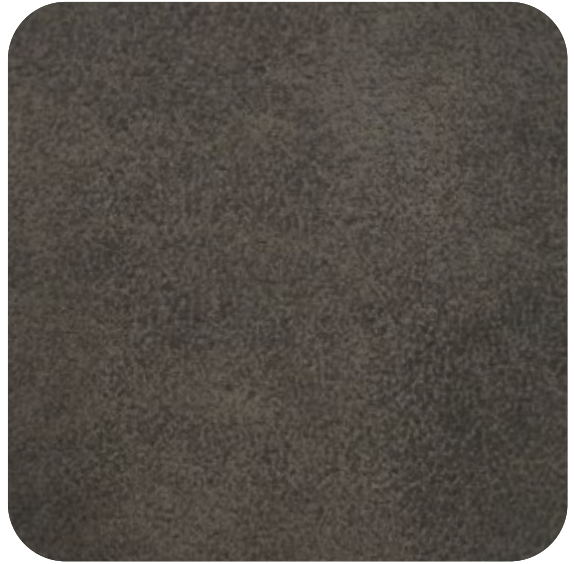
COWBOY - 911