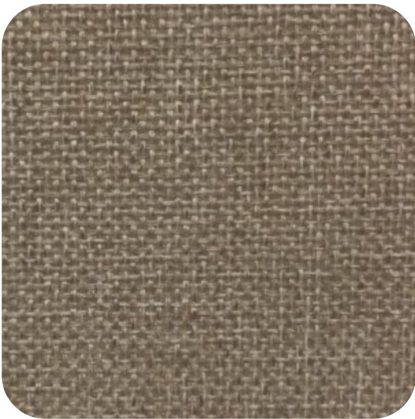
BRISBANE - 704