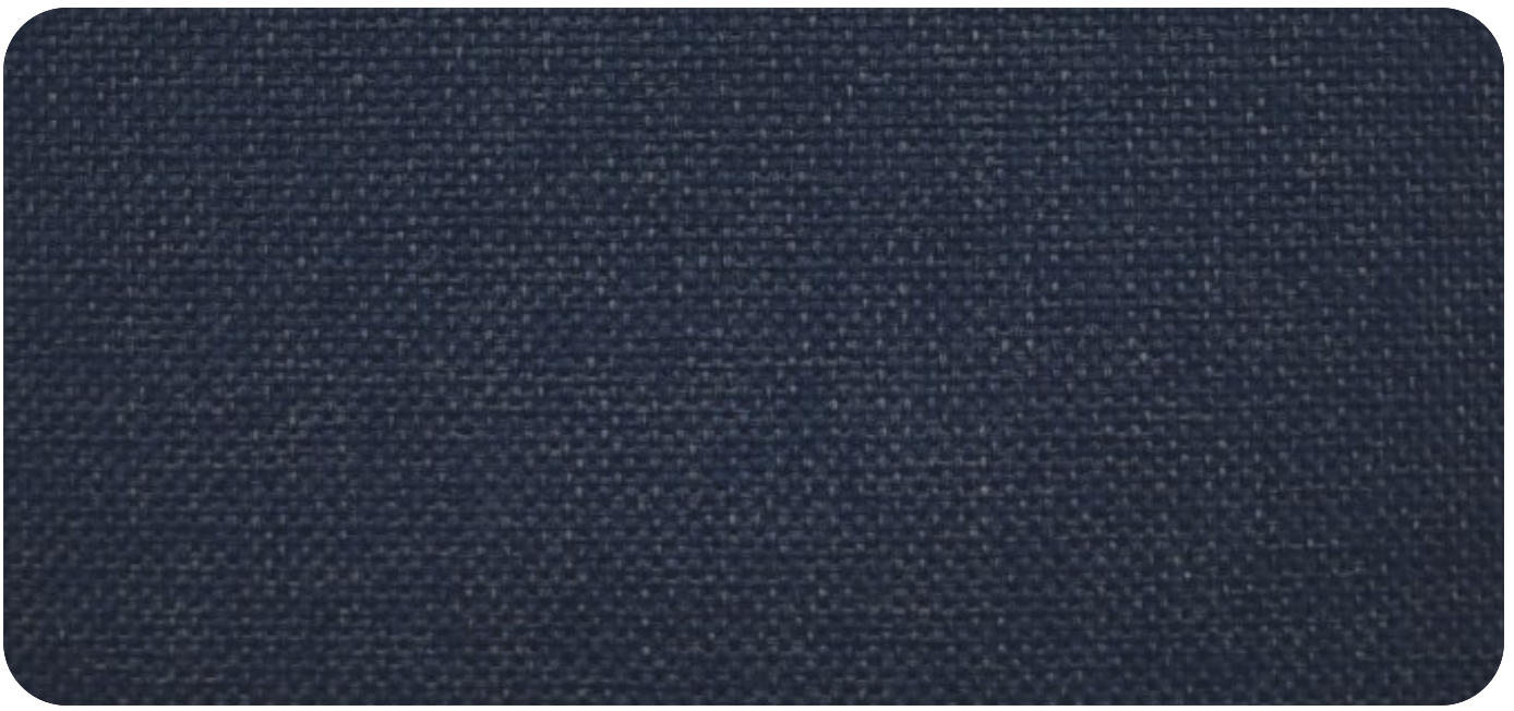
BRISBANE - 714