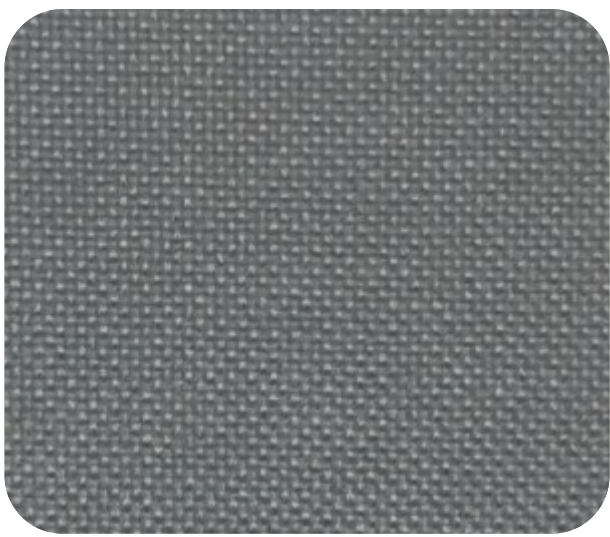
BRISBANE - 713