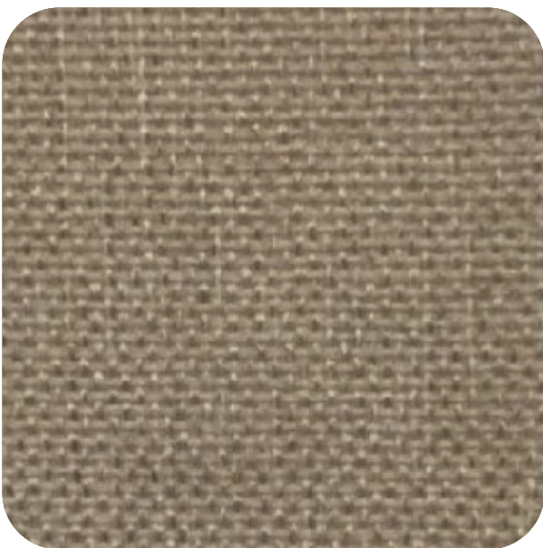
BRISBANE - 703