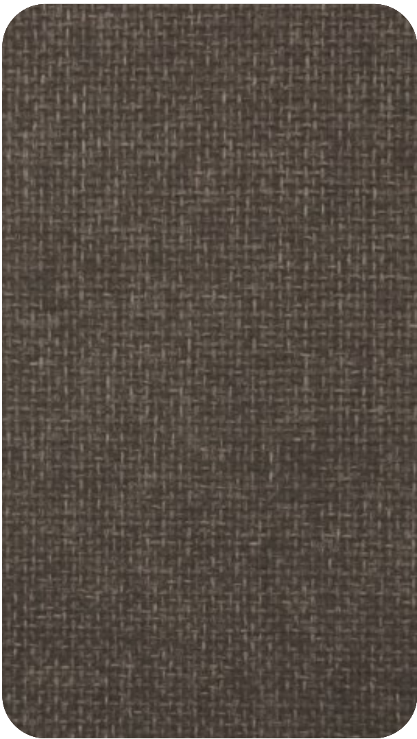
BRISBANE - 716