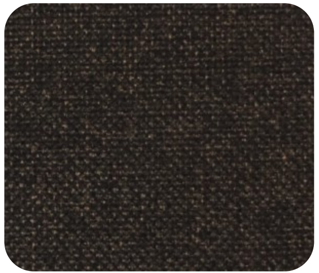
BRISBANE - 708