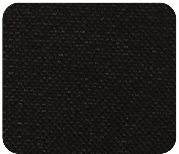
BRISBANE - 720