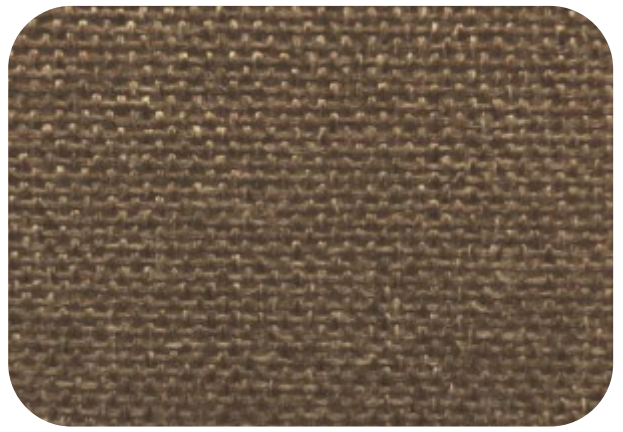
BRISBANE - 706