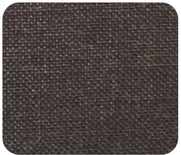
BRISBANE - 718