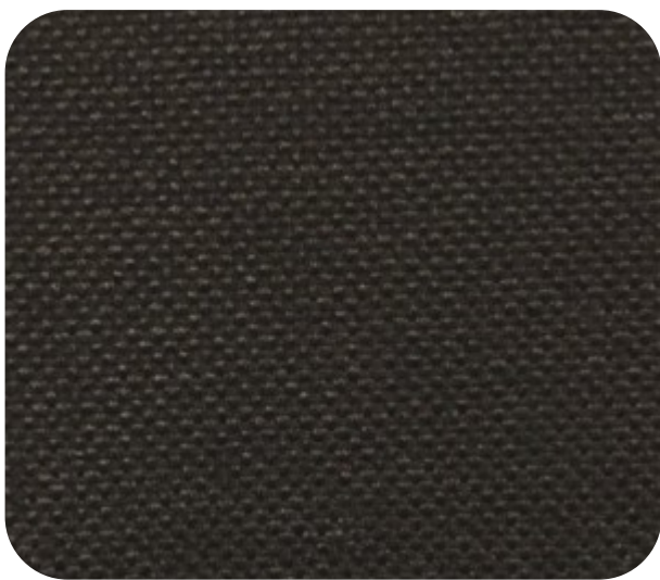
BRISBANE - 719