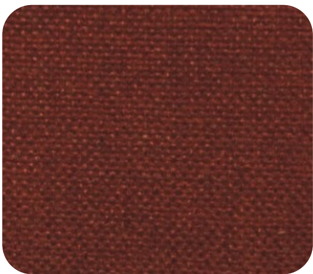
BRISBANE - 709