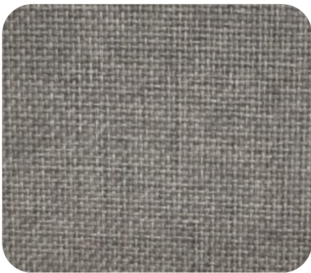
BRISBANE - 717