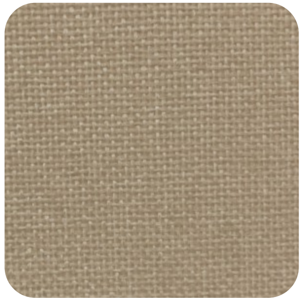
BRISBANE - 702