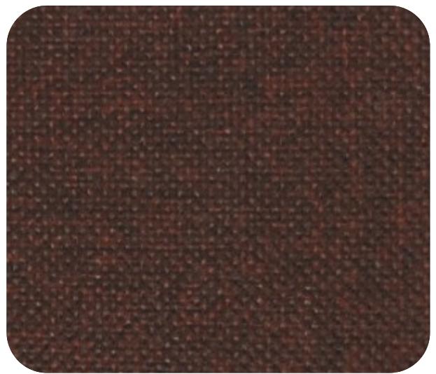
BRISBANE - 710