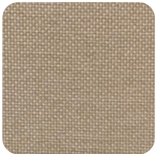
BRISBANE - 701