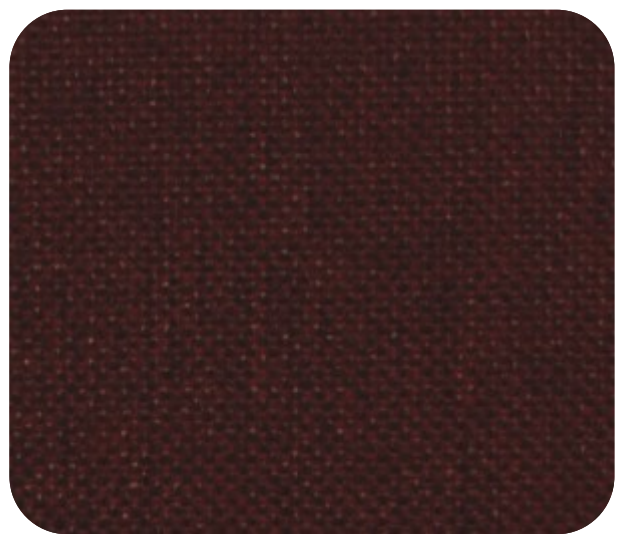
BRISBANE - 711