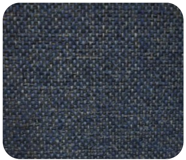
BRISBANE - 715