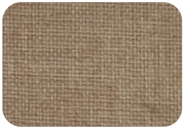
BRISBANE - 705