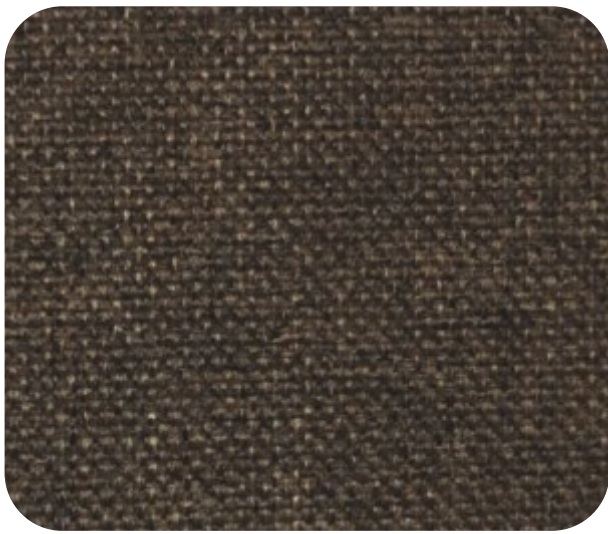
BRISBANE - 707