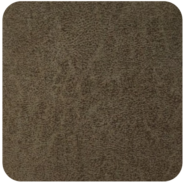
BERLIN - 904