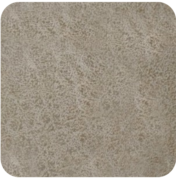
BERLIN - 901