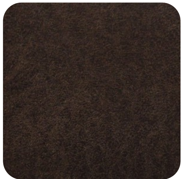
BERLIN - 908