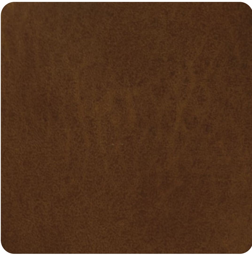
BERLIN - 906