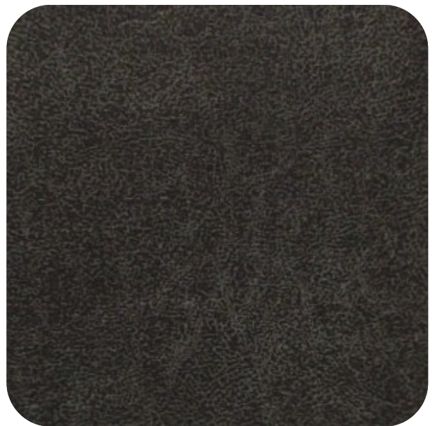
BERLIN - 912