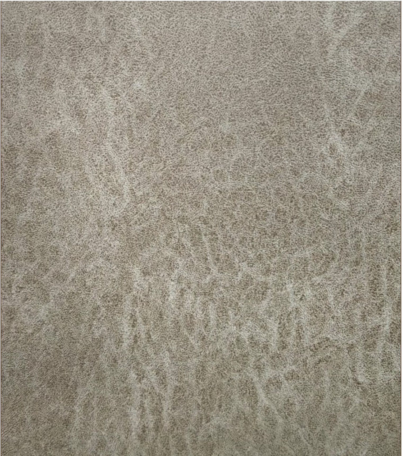
BERLIN - 903