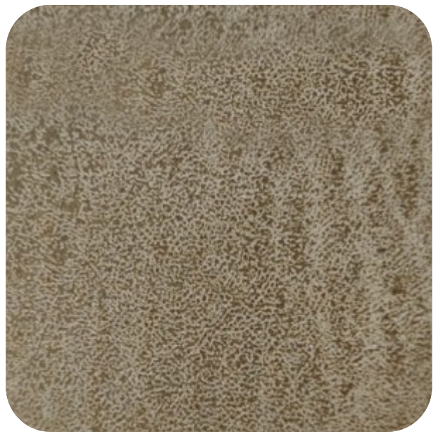
BERLIN - 903