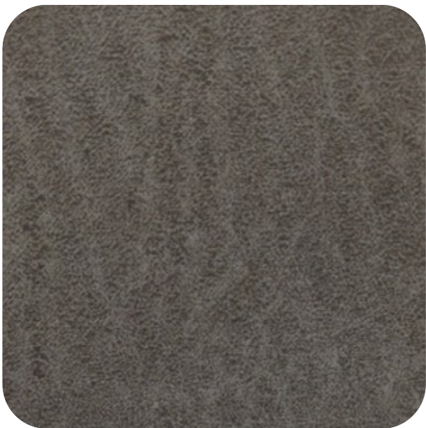
BERLIN - 911