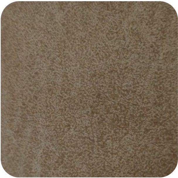
BERLIN - 902