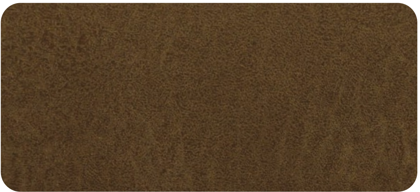
BERLIN - 905