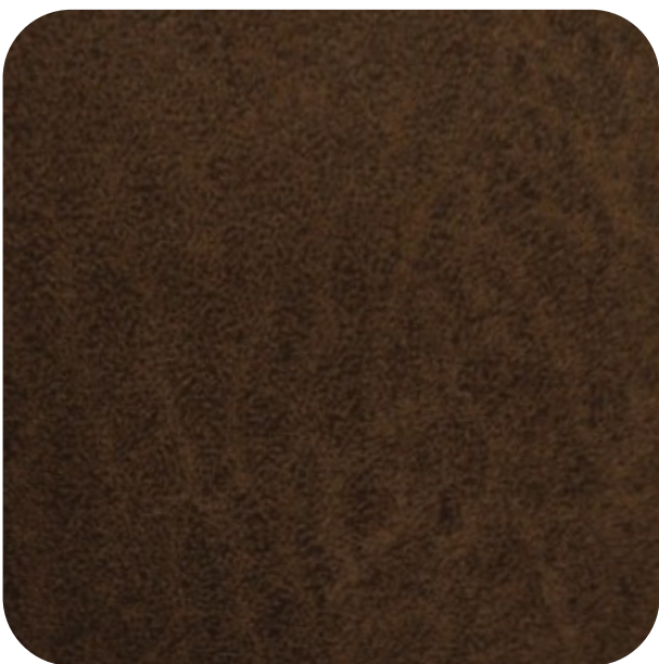
BERLIN - 907