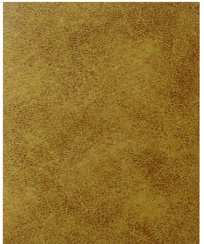
★ ASMARA | 713