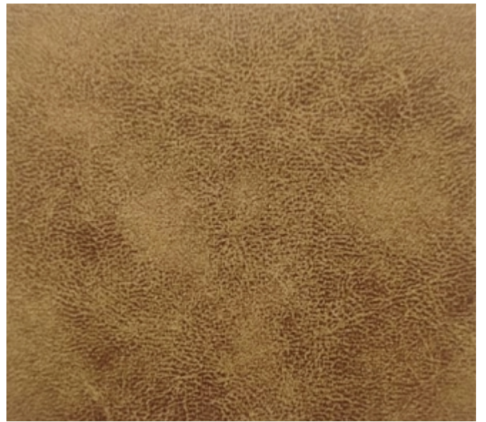
ASMARA | 705