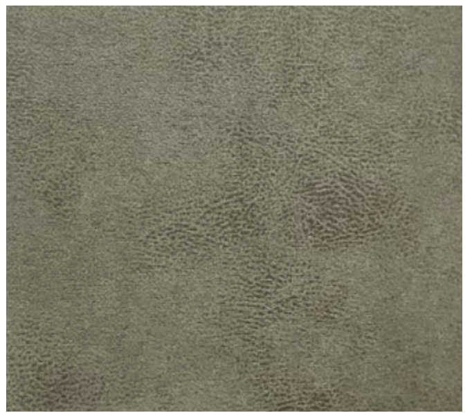
ASMARA | 710