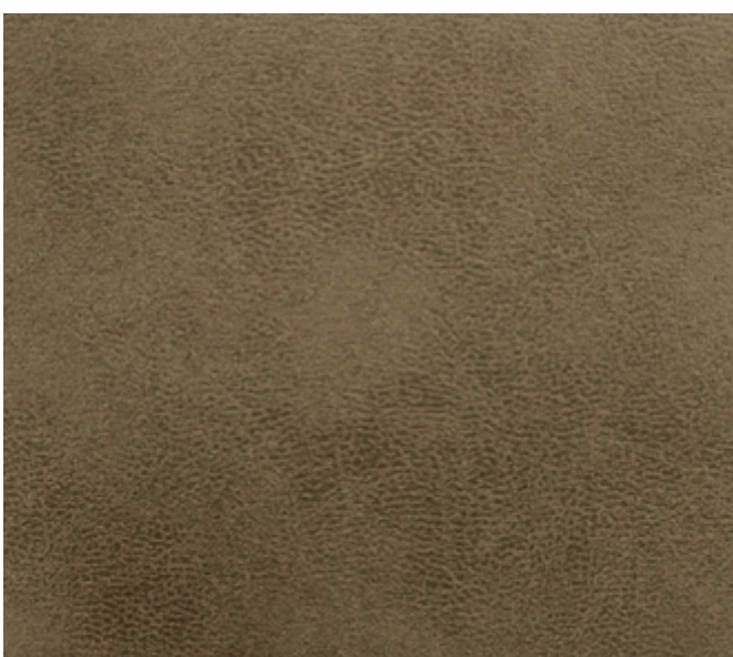
ASMARA | 704