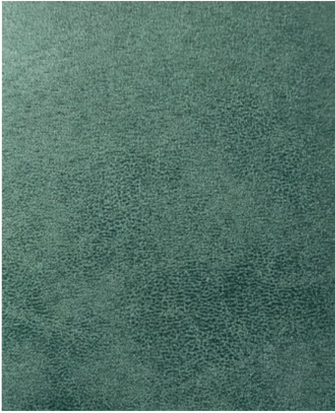
★ ASMARA | 716