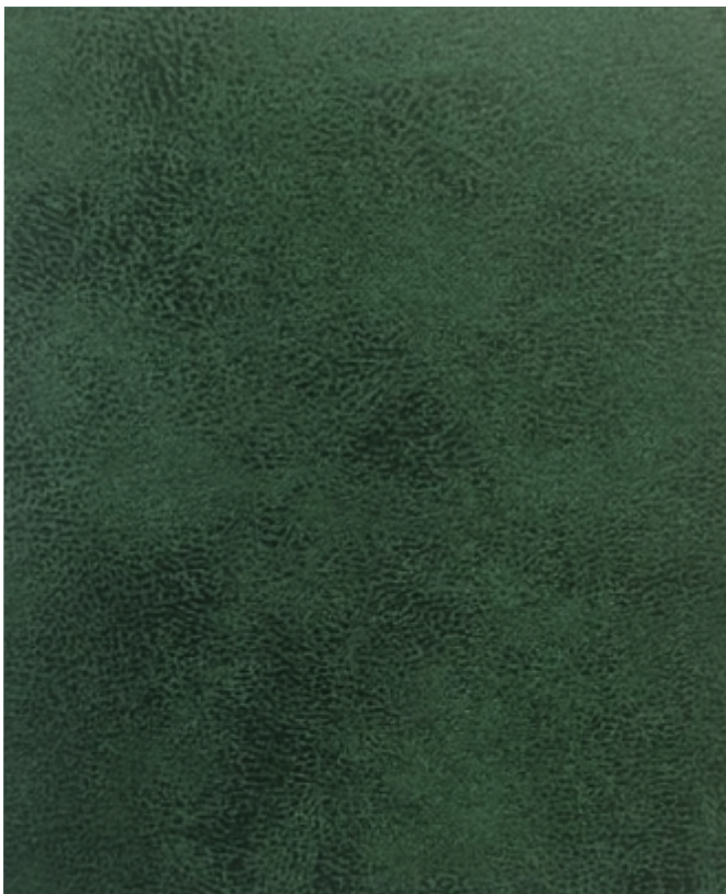
★ ASMARA | 717