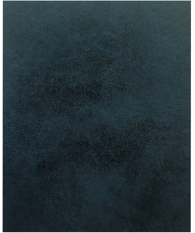
★ ASMARA | 720