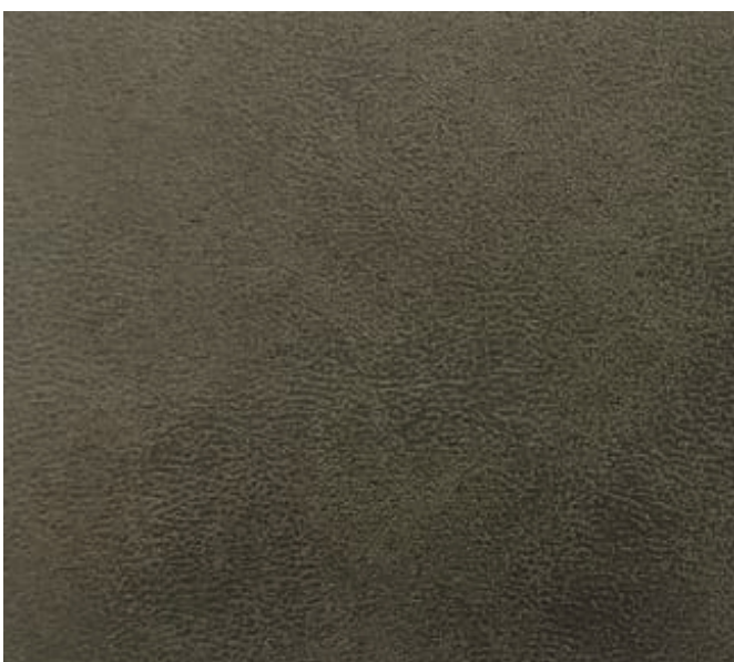
ASMARA | 712