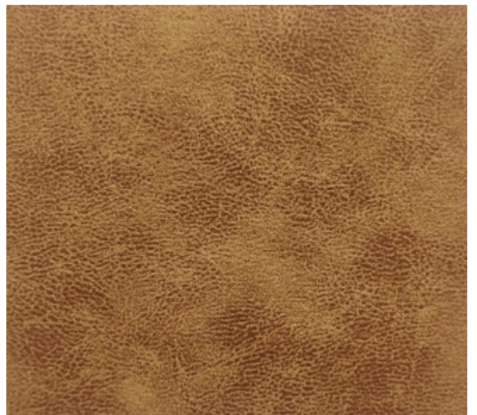
ASMARA | 706