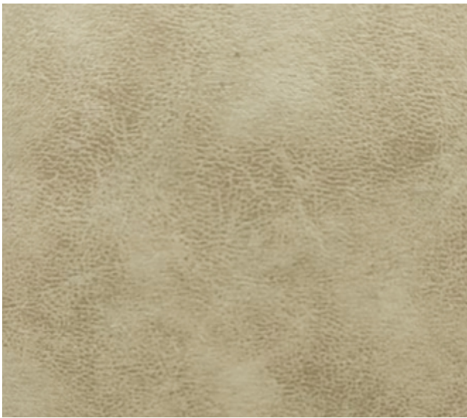
ASMARA | 701