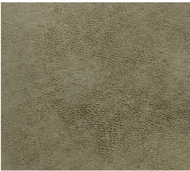
ASMARA | 709