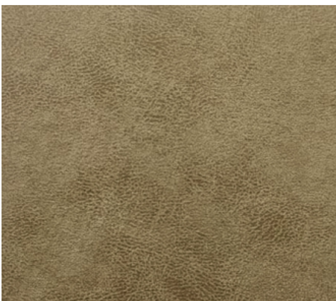
ASMARA | 703