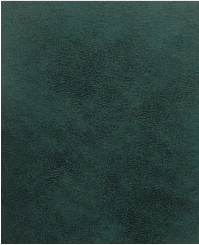
★ ASMARA | 718