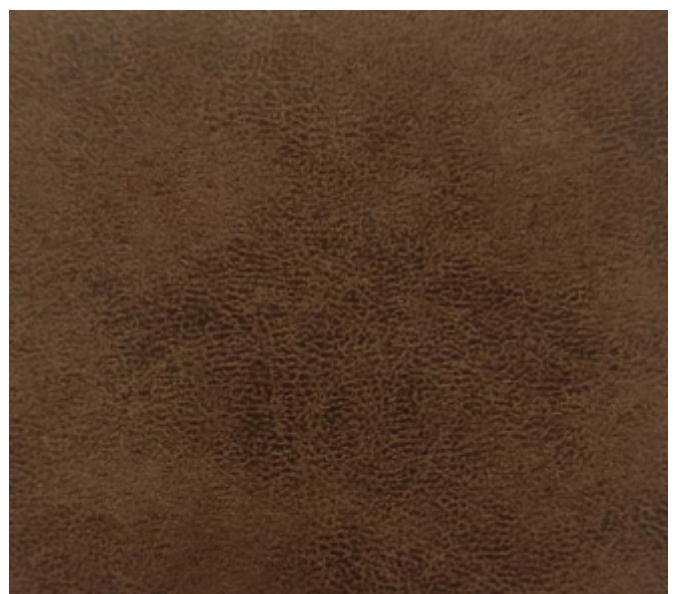
ASMARA | 707