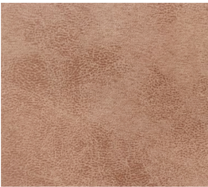
★ ASMARA | 714