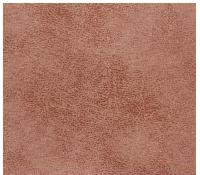
★ ASMARA | 715