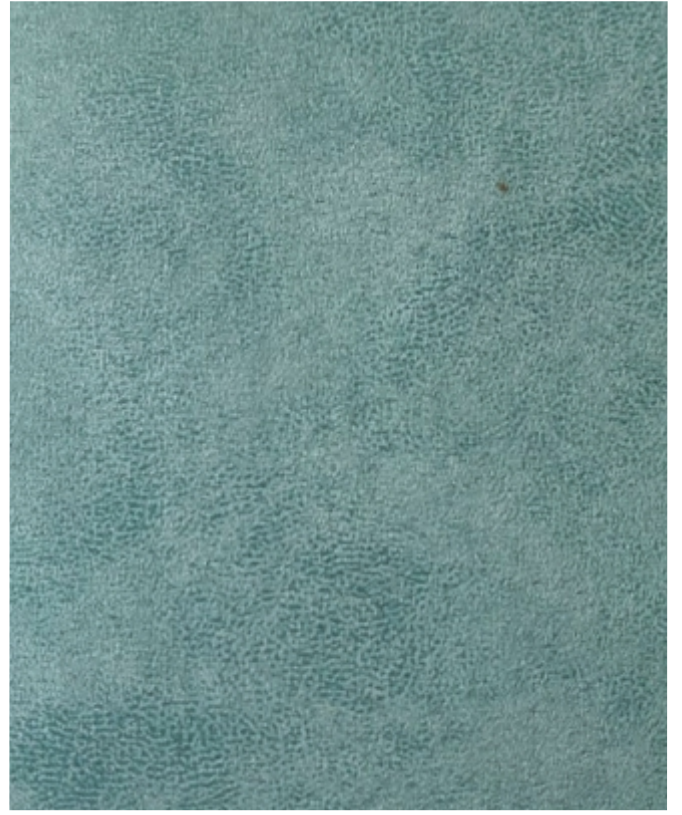
★ ASMARA | 719