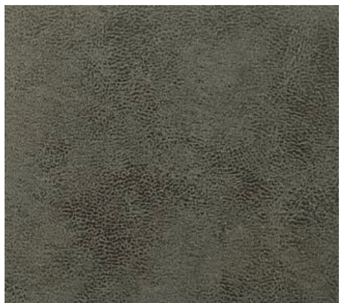
ASMARA | 711