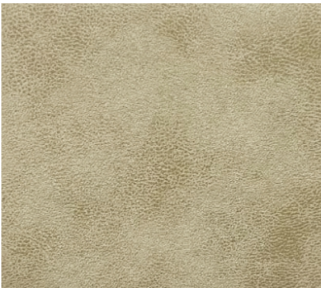
ASMARA | 702